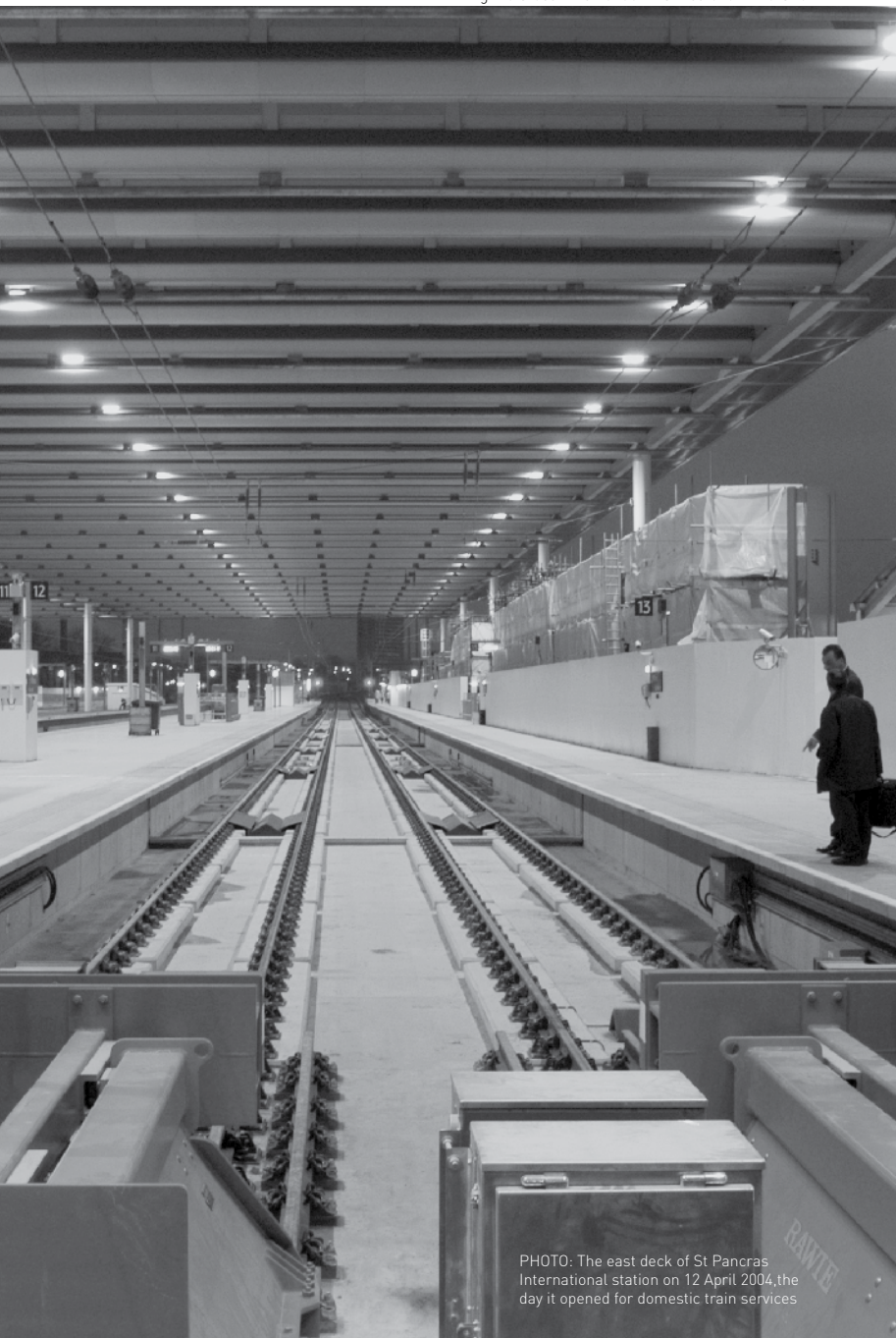
PHOTO: The east deck of St Pancras International station on 12 April 2004, the day it opened for domestic train services