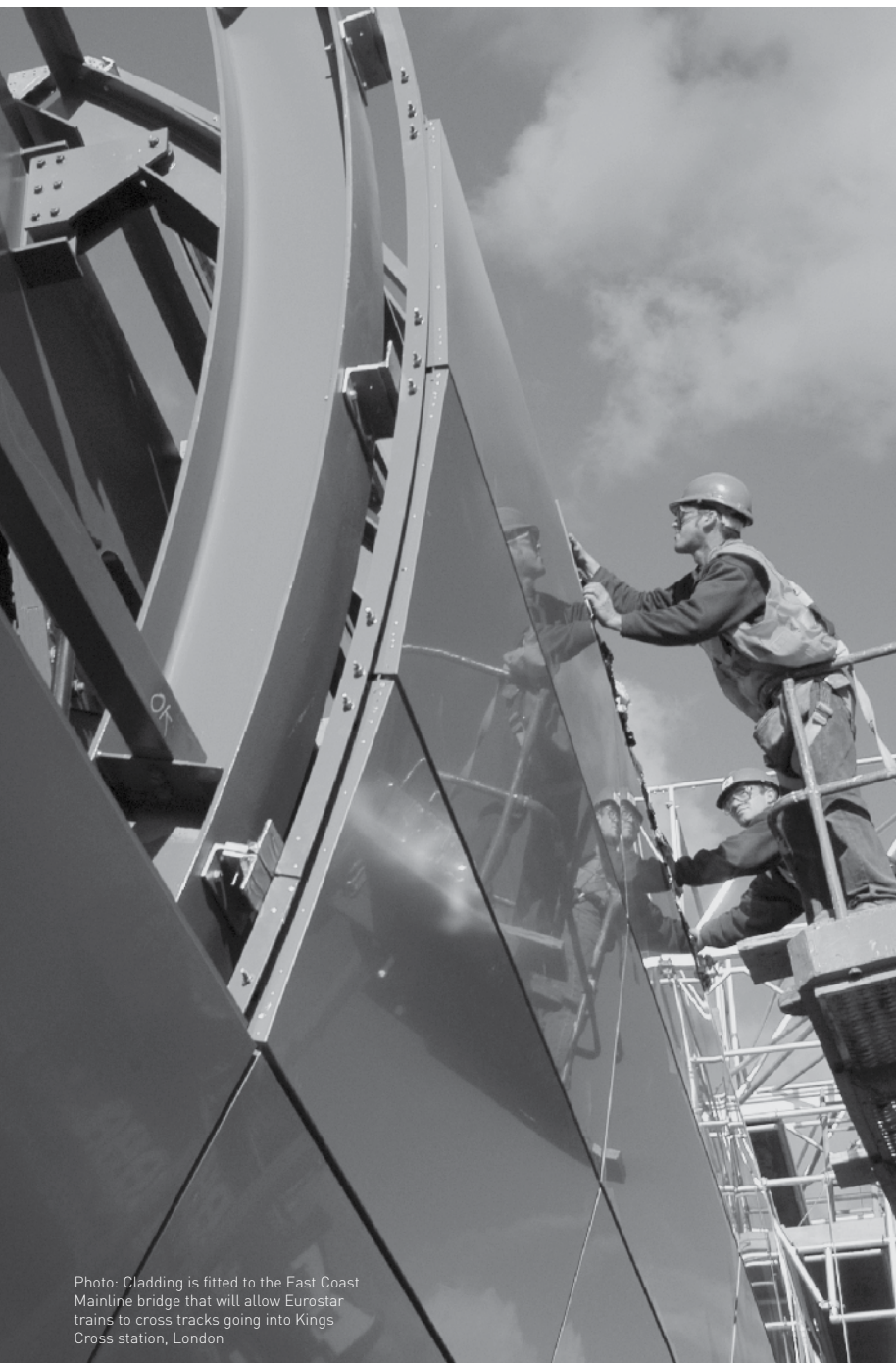
Photo: Cladding is fitted to the East Coast Mainline bridge that will allow Eurostar trains to cross tracks going into Kings Cross station, London