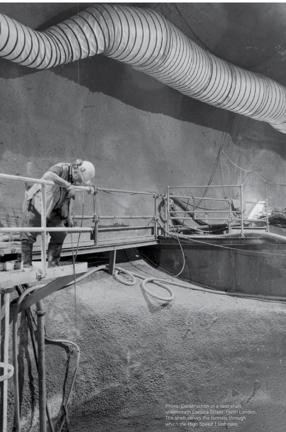
Photo: Construction of a vent shaft underneath Corsica Street, north London. The shaft serves the tunnels through which the High Speed 1 line runs.