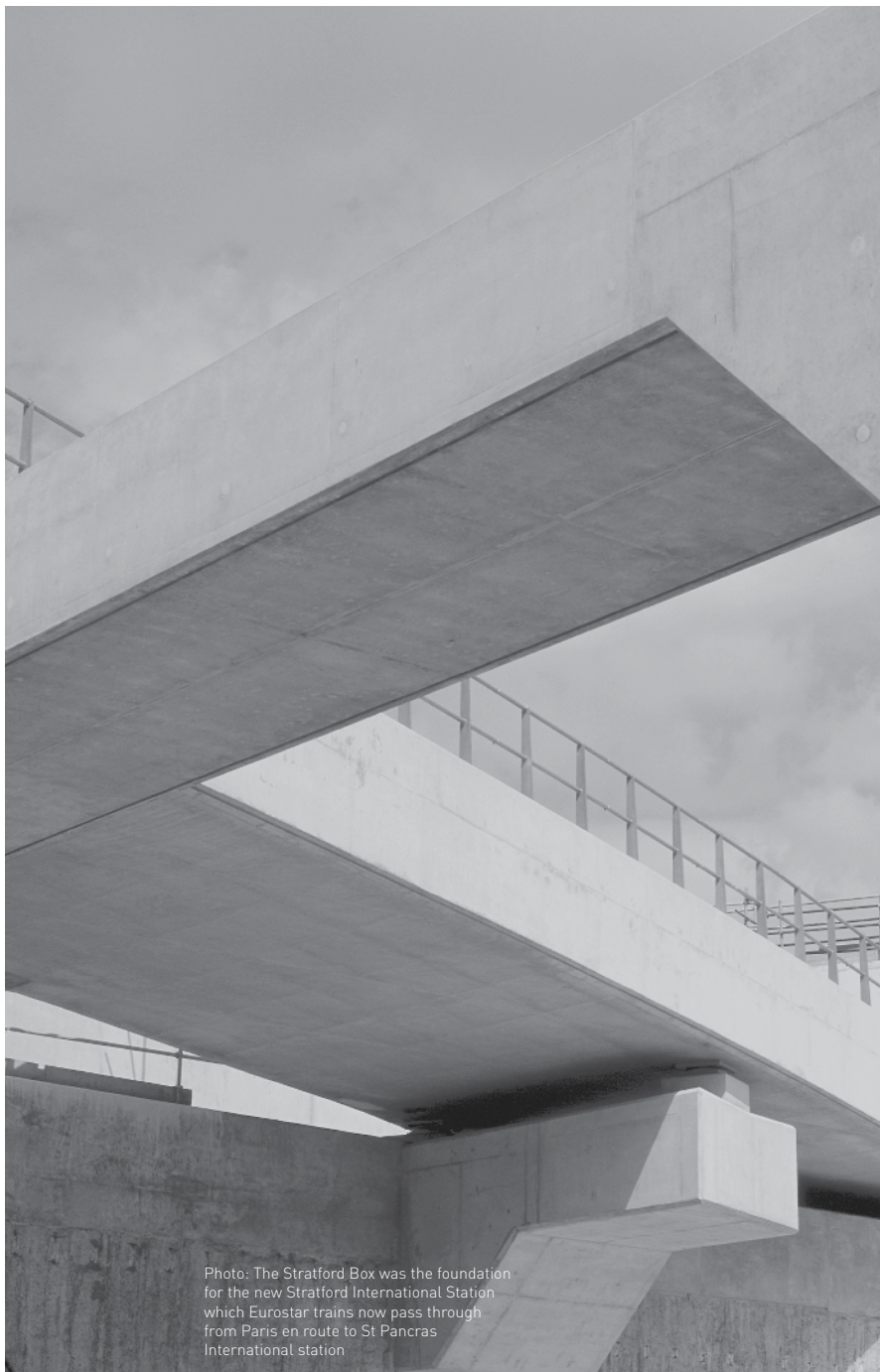
Photo: The Stratford Box was the foundation for the new Stratford International Station which Eurostar trains now pass through from Paris en route to St Pancras International station